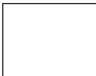
LEFT THUMBMARK OF APPLICANT